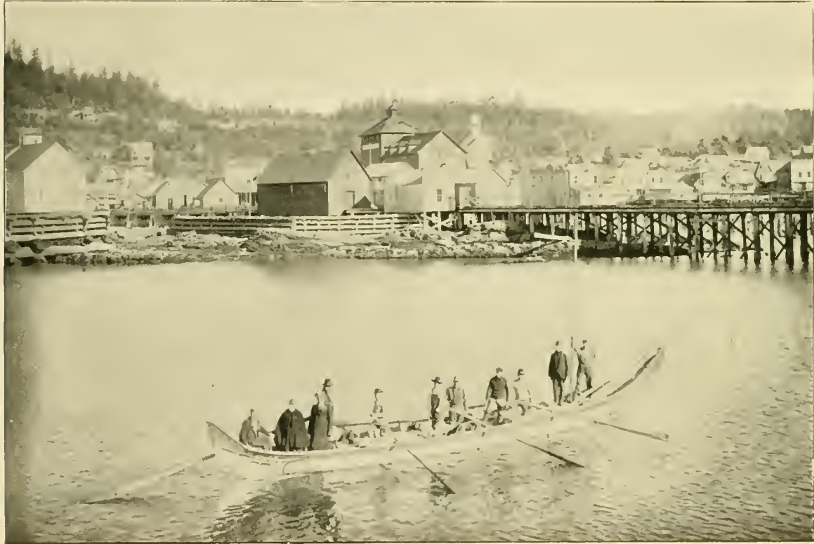
Indian Canoe starting up River with Freight and Passengers.